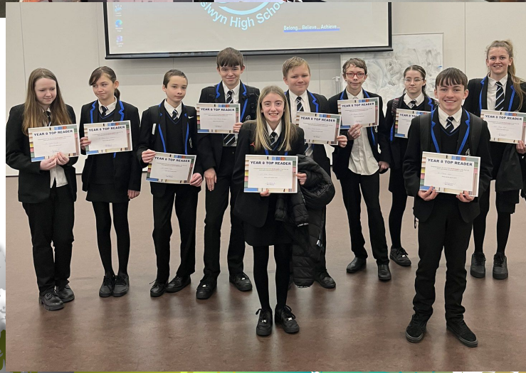
Year Group Competition